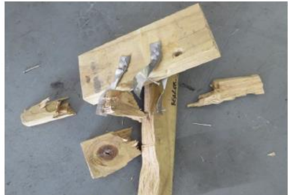
Failure after loading