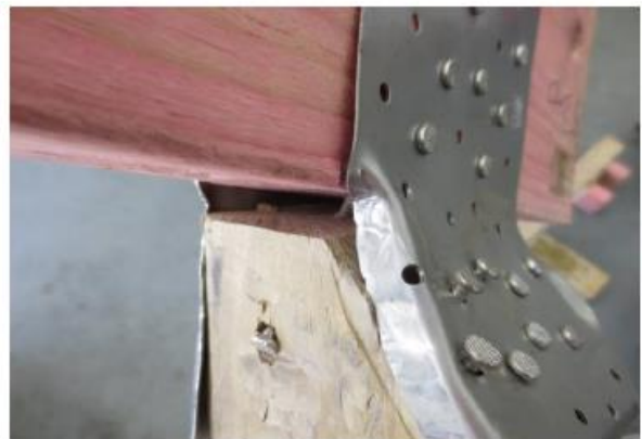
Failure after loading